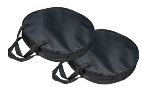
The cables come with a bag