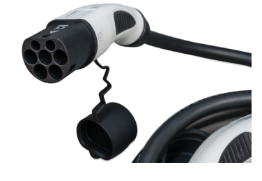
AC Charging Plug: DS IEC2b-EV32P