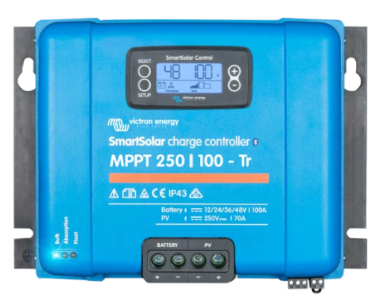
SmartSolar Charge Controller MPPT 250/100-Tr with pluggable display

Compensates absorption and float charge voltage for temperature.