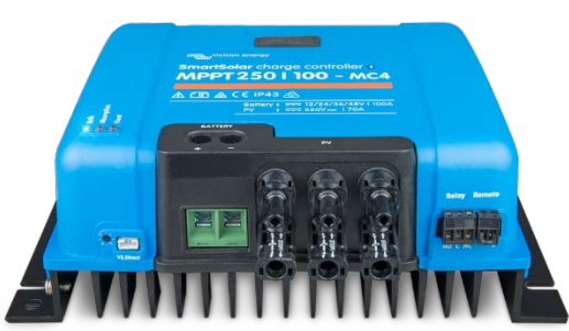
SmartSolar Charge Controller MPPT 250/100-MC4 without display