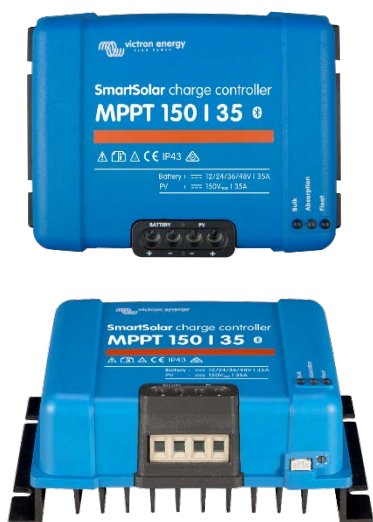
SmartSolar Charge Controller MPPT 150/35