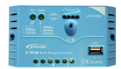
Integrated controler with USB outport