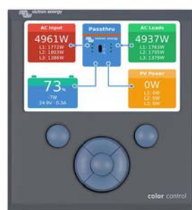
Color Control panel, showing a PV application