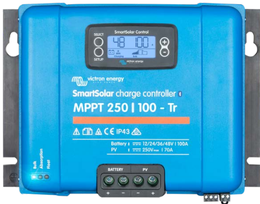
Solar Charge Controller MPPT 250/100-Tr with pluggable display