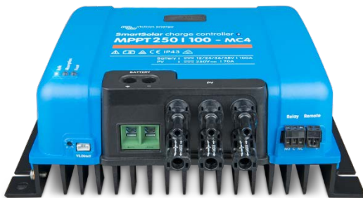
Solar Charge Controller MPPT 250/100-MC4 without display