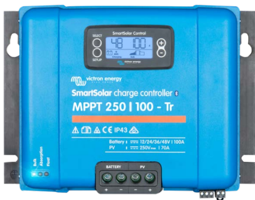
SmartSolar Charge Controller MPPT 250/100-Tr with pluggable display